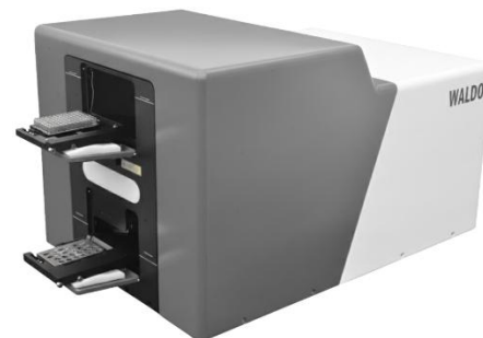
Figure 1. WALDO is a fully automated THz-Raman™ system, designed for high-through screening and characterization of polymorphs and crystallinity of materials such as active pharmaceutical ingredients (APIs).

Raman, High Throughput Screening, Polymorphs, Crystallinity, Polarized Light Microscopy, Pharmaceuticals, Biopharma